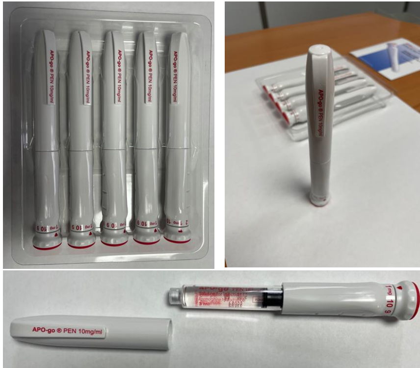
Table 2: Comparison of outer and inner labels of UK-labelled APO-go PEN and Movapo (previously marketed in Canada)